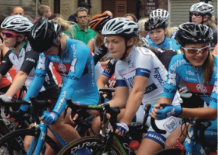
- MORE PEOPLE CYCLING MORE OFTEN